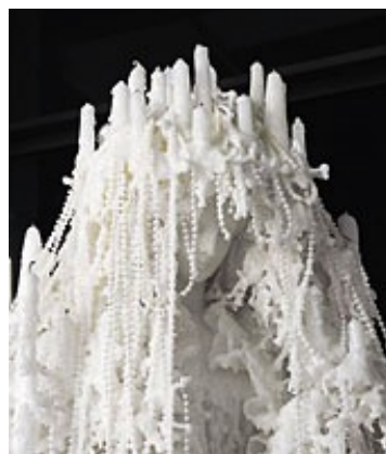
Detail, Untitled #1093 (Buddha Boy), 2001