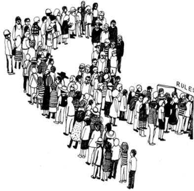
Geoff McFetridge, Rules , 2009