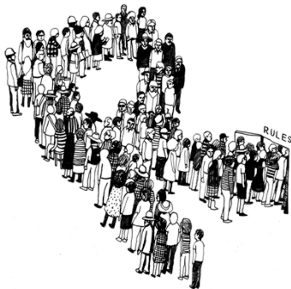
Geoff McFetridge, Rules , 2009