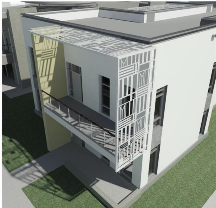
Awnings over the front entrance and exterior courtyard are an abstracted flag canopy pattern. Patterned shadows are intended in both spaces.