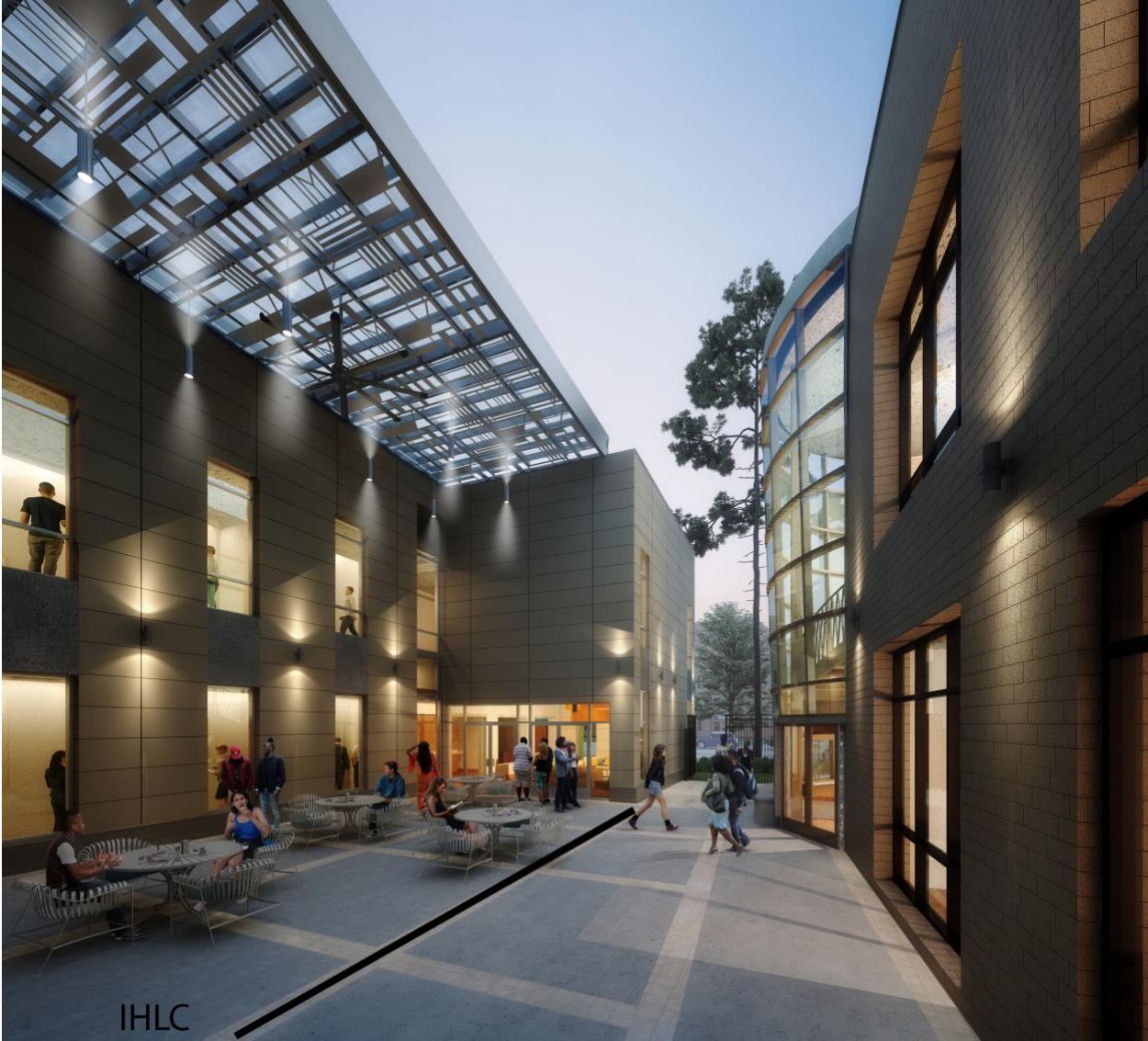
View looking south