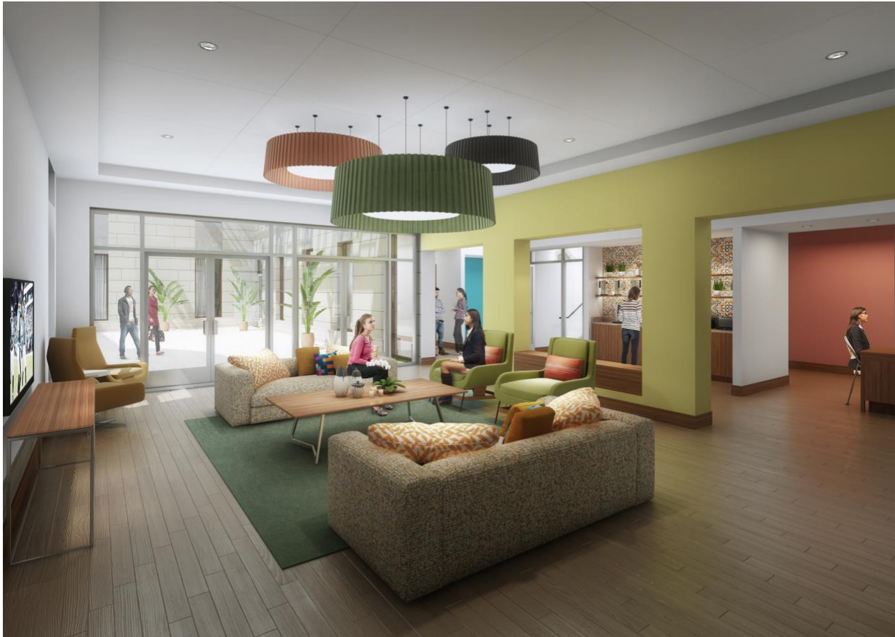
“Living Room” interior showing the palette of bright colors used throughout the interior spaces. (Shown for context. Interior spaces are not a site for art.)