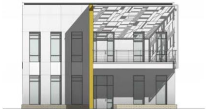
South Entry Elevation