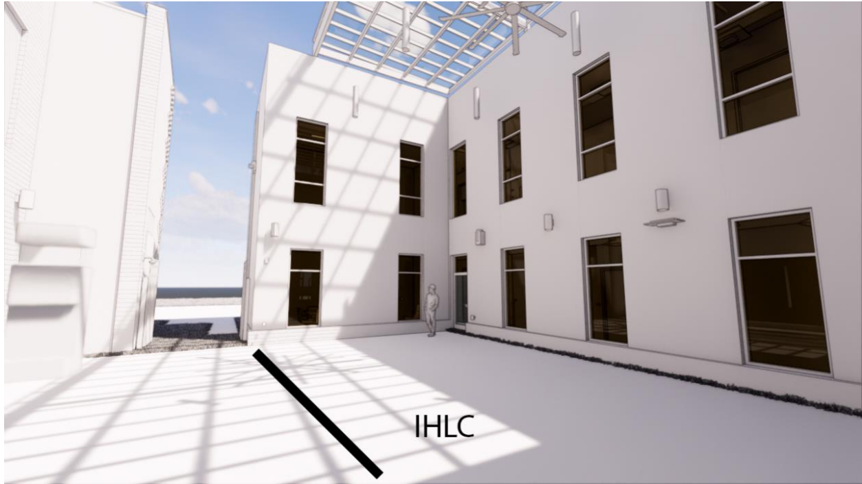
View looking north. Shadows will be an abstracted flag pattern.