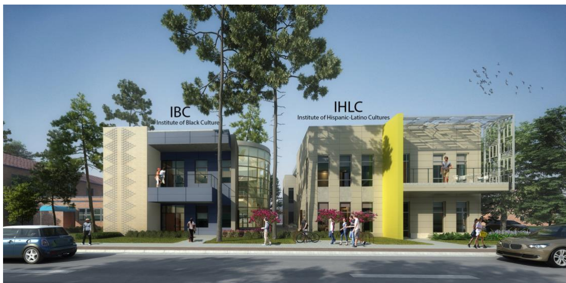
View looking north