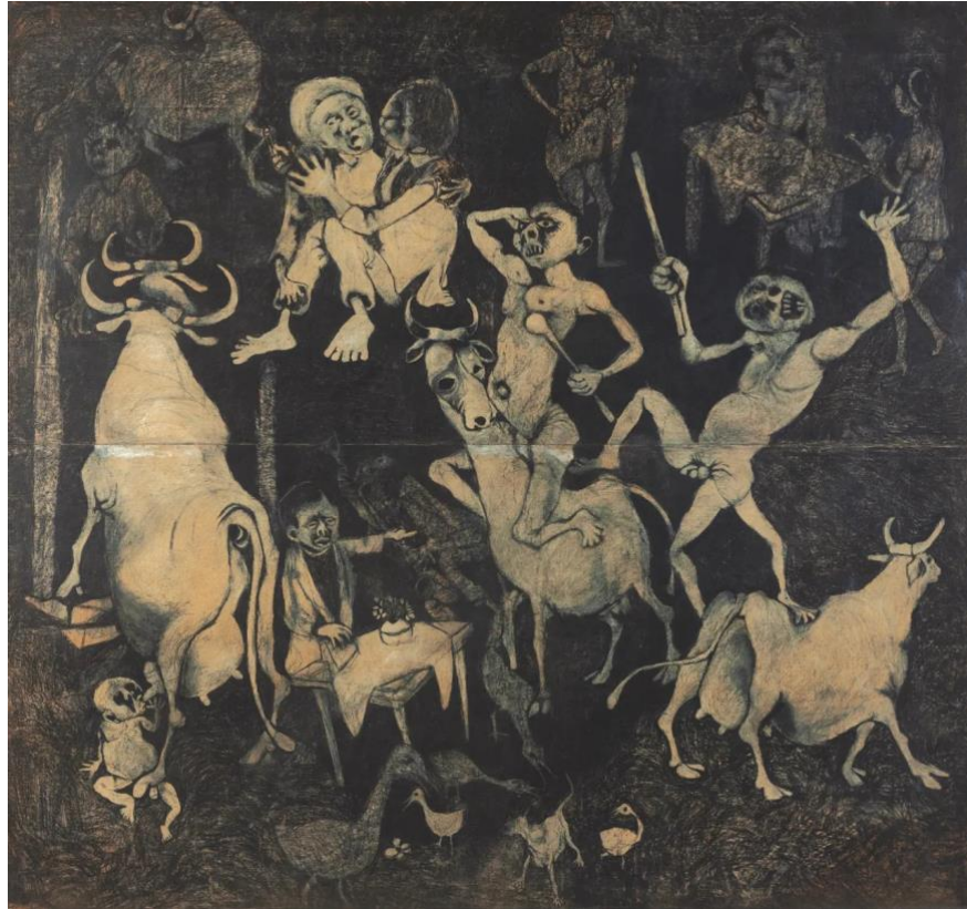
Image: Dumile Feni, African Guernica , 1967.