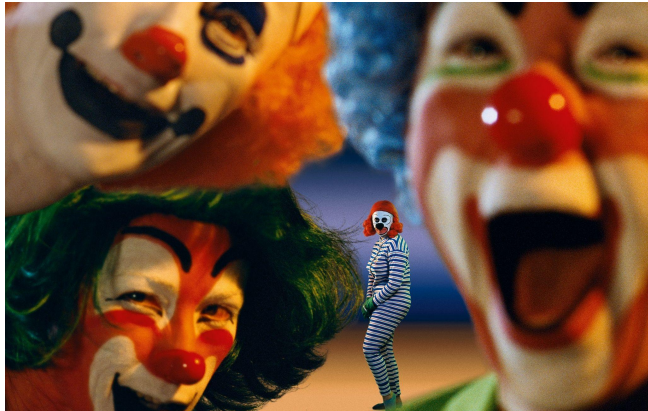
Untitled #425, Cindy Sherman, 2004