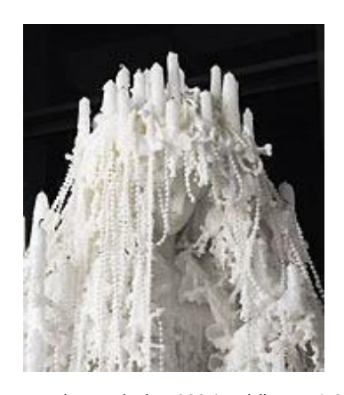
Detail, Untitled #1093 (Buddha Boy), 2001