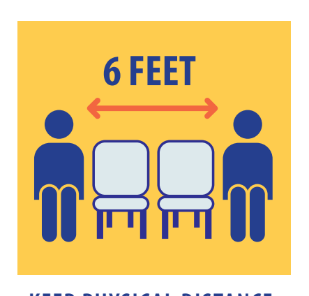
KEEP PHYSICAL DISTANCE.