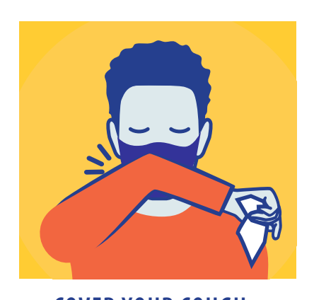
COVER YOUR COUGH.