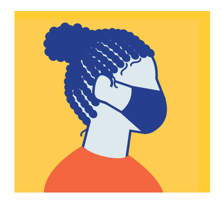
WEAR A MASK.