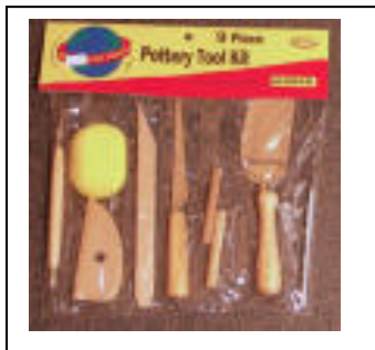
Modeling tools - wood or metal, a variety

Basic set of tools – a tool kits is sold at the Reitz Bookstore, Michaels, Axner (Orlando) and Highwater Clay in St. Petersburg http://www.highwaterclays.com/