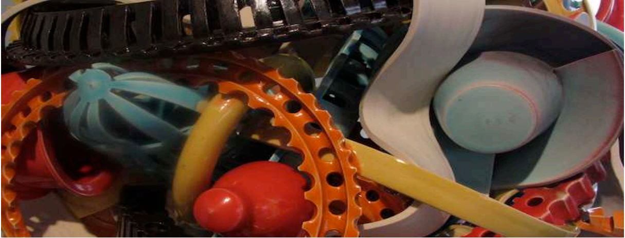
Ryan Labar, Detail

Office: FAC B17 Office Hours: T 3 – 4 PM and W 3 – 4 PM also by appointment ach@ufl.edu