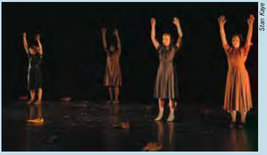
Witness, 2009 BFA Showcase

Witness premiered in the Fall BFA Dance Showcase 2009, which