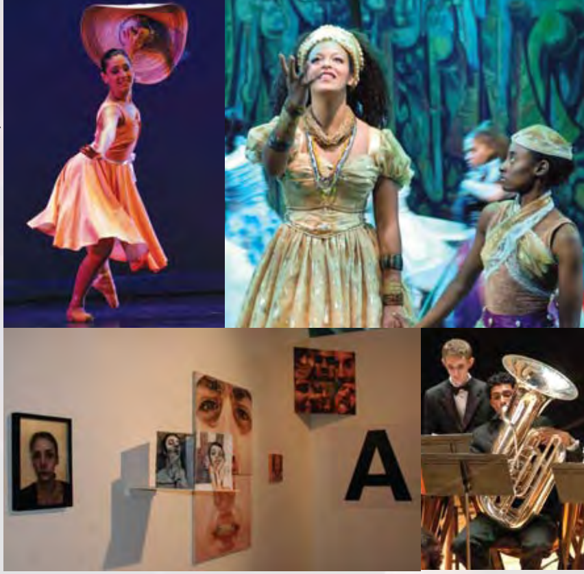
BFA and BM degrees at New World School of the Arts are conferred by UF College of Fine Arts.

NWSA is located in Miami, Florida, and was created by the Florida Legislature as a cooperative venture of Miami-Dade County Public Schools, Miami Dade College and the University of Florida. The institu-