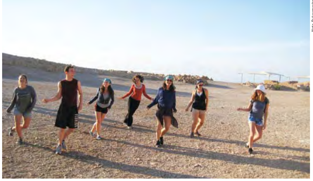
UF dancers stay on the move while touring in Masada, Israel. Participants were part of the inaugural UF in Israel program for dance students—one of many international summer programs offered by the College of Fine Arts.

s the Gator Nation continues to globalize, many Gators are finding that art plays an important role in cross-cultural communication. This summer, the College of Fine Arts offered a number of programs which gave student-artists the opportunity to find out for themselves.