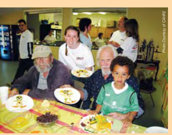
Local seafood industry workers and their families enjoyed making art from healthy foods at a community health fair, which culminated the week-long project.

The eyes of several University of Florida students were opened by more than just sunshine this past spring break. The group was exposed to a unique culture while using the arts to deliver health messages in an area known as Florida's "Forgotten Coast."