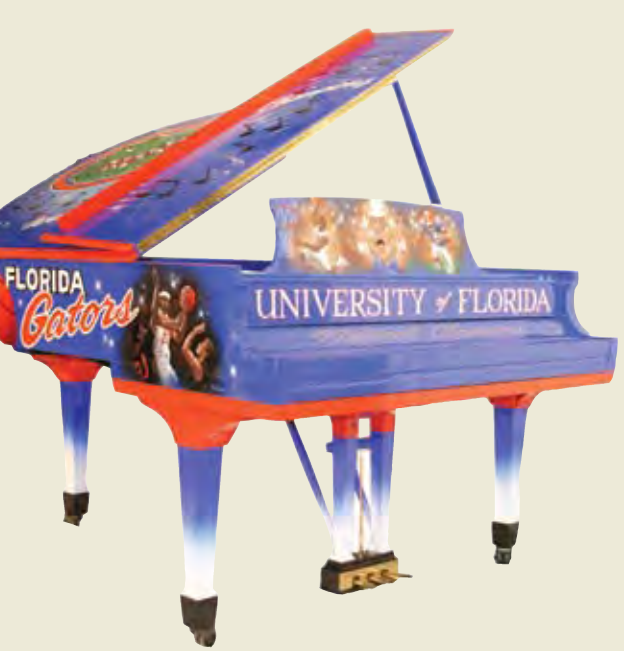
This "Gatorized" Steinway model M piano is being auctioned to benefit the School of Music. Visit: arts.ufl.edu/gatorpiano

UF is one of only three schools in Florida that have obtained this designation and has joined the ranks of esteemed music programs in only about 55 colleges, universities and conservatories nationwide with the All-Steinway distinction, including The Juilliard School, Yale University School of Music and Oberlin College Conservatory.