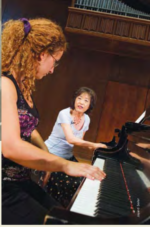
UF International Piano Festival brought together students and faculty from around the globe in Summer 2010.