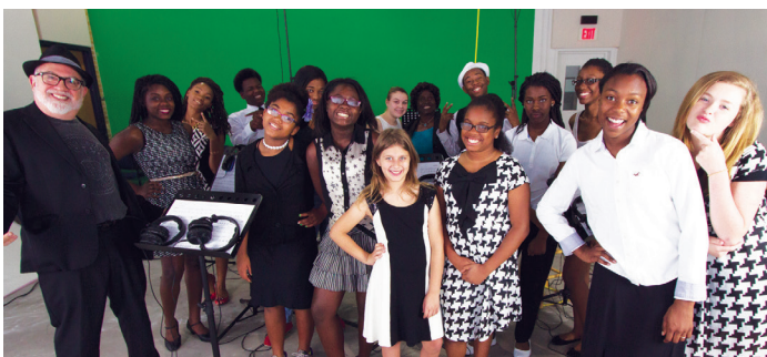
The composer joins vocalists from Star Center Children's Theatre in the studio to record their performance of "A World Wide House."

Let's all celebrate Dr. King as a true American hero!