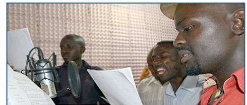
Artists recording the Rockpoint 256 radio drama in Uganda (Y.E.A.H., 2012)

Response: The arts facilitate dialogue, allow communication around culturally sensitive subjects, and can be used to reveal underlying social issues that influence behaviors, including cultural beliefs, stigma, and traditions. This level of understanding and dialogue is essential to influencing long-standing cultural practices, including those surrounding caregiving and burial, which contribute to the spread of Ebola. The arts are a natural and efficient means for dispelling myths and misconceptions that may discourage care seeking, and for sharing information that empowers local communities with information required for effective response and disease management. Theatre and drama programs, including serial radio dramas, have been widely demonstrated to be an effective means for facilitating dialogue related to cultural practices. Radio drama has been found to be the most cost effective channel for mass media health messaging and can be strategically used for rapid and meaningful messaging to large population segments.