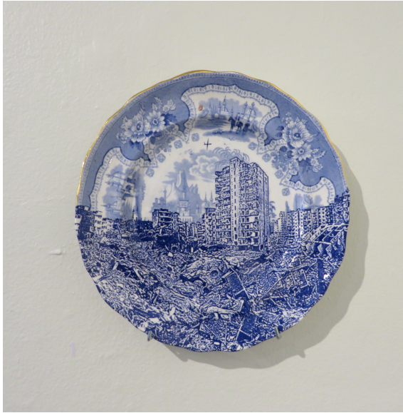
Paul Scott, England, transfer ware

NOTE: I look forward to an enjoyable and productive semester working together. Should you have problems with your assignments or questions about your progress, you are encouraged to make an individual appointment for help or information.