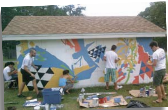
SA + AH drawing students create murals at Tacachale, a residential facility in Gainesville for people with developmental disabilities.

The College of Fine Arts launched its first online masters program in summer 2010. "Without compromising the traditional humanity of art making, our graduates will empower students to express themselves in ways not possible before," said Professor Craig Roland.