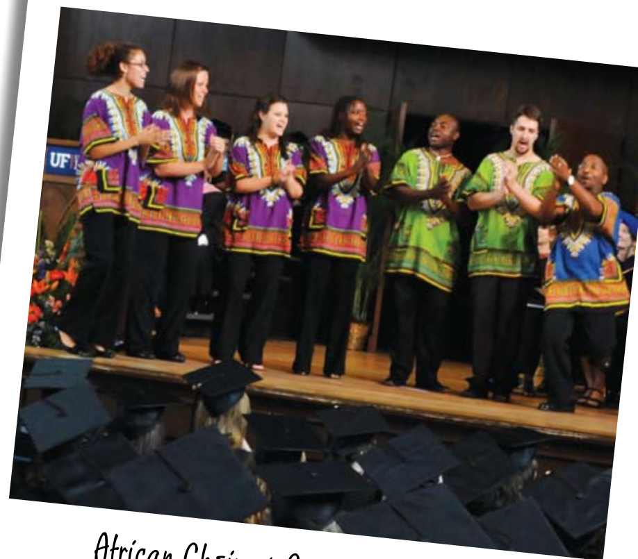
African Choir at Commencement 2010

Spring commencement for the College of Fine Arts is a special and upbeat celebration, infused with the sights, sounds and creativity of our college.