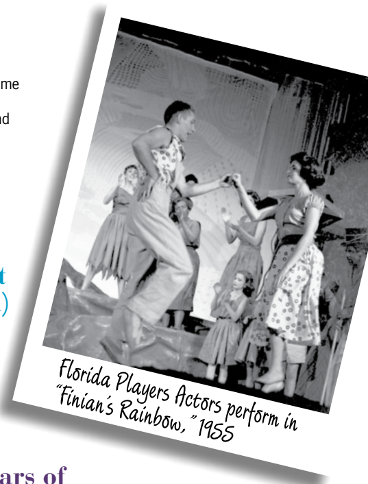
Florida Players Actors perform in "Finian's Rainbow," 1955

There is no bond stronger than the one formed when you become a member of The Gator Nation. In every corner of the globe, Gators accomplish remarkable feats with innovative thinking and inspired collaboration.